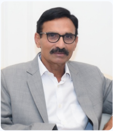
Justice L. Nageswara Rao